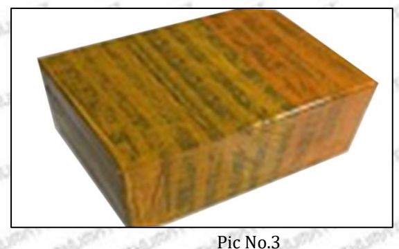
International express packaging: Wrapped with yellow tape after wrapping black protective film

Mob/Whatsapp: +86 13410541523 Tel: +8675523215133 Email: ruby@shumatt.com Website: www.shumatt.com